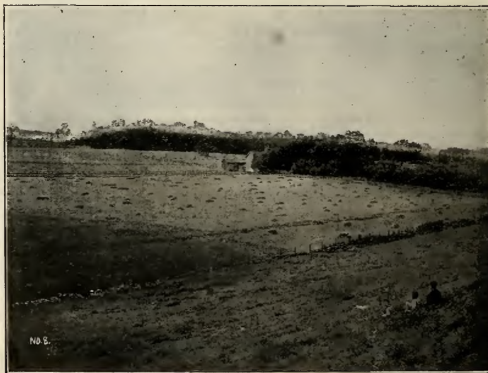
A scene near the sacred grove

The translation of the Book of Mormon proceeded; finally, in March, 1830, the book was printed in an edition of 3,000. Its contents, its further career and circulation, the credibility of the testimony of its witnesses, the predictions in the Bible of its coming forth, and some of the new and marvelous doctrines contained therein, and other facts concerning it, are further treated in the articles in this number of the Era , as contributions in memory of the hundredth anniversary of the day when the sacred plates of the Book of Mormon were first shown to Joseph Smith in the Hill Cumorah.—A.